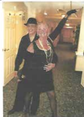
Ballroom and Latin Dance Class

Come out and socialize, exercise and have fun. Learn Foxtrot, East Coast Swing, Cha Cha Waltz. Learn some of the most popular Latin Dances like Merengue Rumba, Salsa, even a little hustle dance.