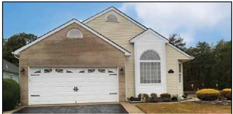
185 PRINCE CHARLES DRIVE - SOLD THIS COULD BE YOUR HOUSE!

With more than 30 years of real estate experience, our agents have been able to assist hundreds of clients buy or sell their homes with confidence. It's not easy doing it alone, that's why we'll be by your side every step of the way!